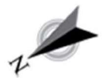
TOWER 4 TYPICAL FLOOR PLAN ODD FLOORS