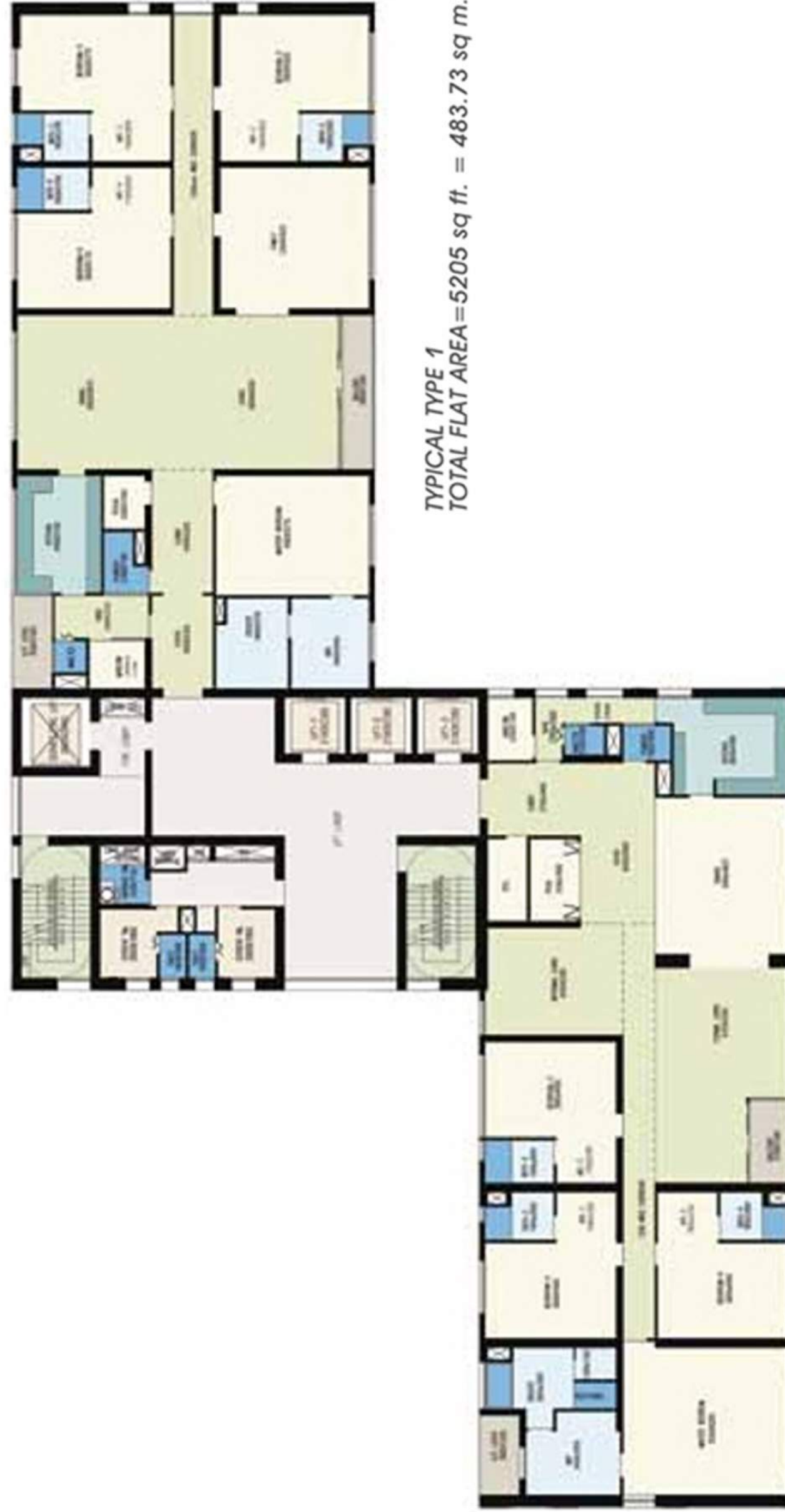
TYPICAL TYPE 1 TOTAL FLAT AREA = 5205 sq ft. = 483.73 sq m.