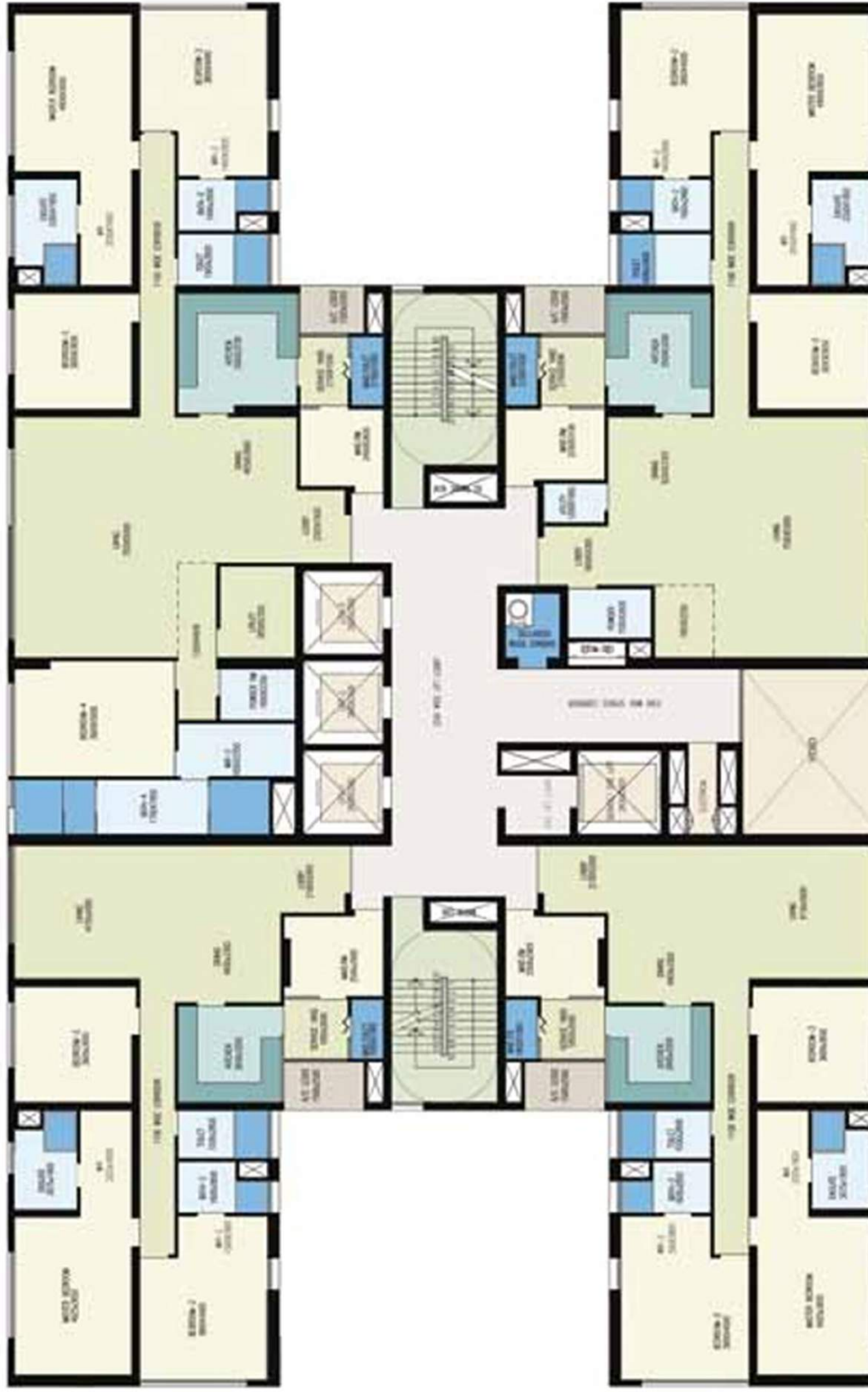
TYPICAL 3 BEDROOM TYPE 2 TOTAL FLAT AREA = 2393 sq ft. = 222.39 sq m.