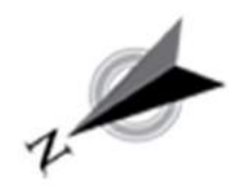
TOWER 7 1st - 39th FLOOR