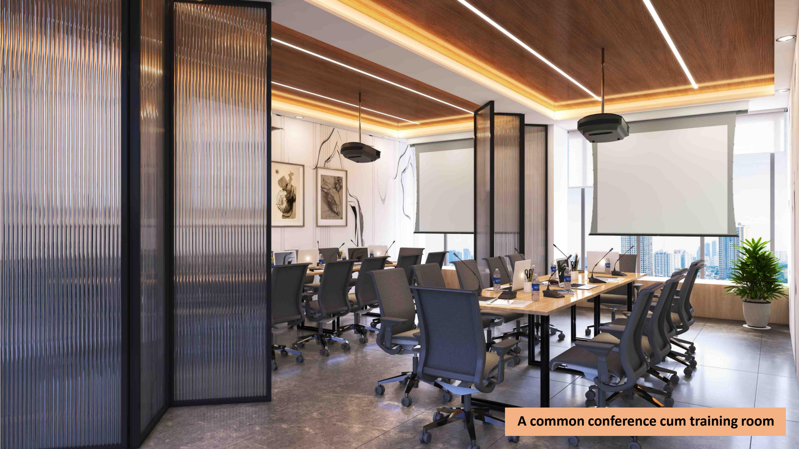
A common conference cum training room