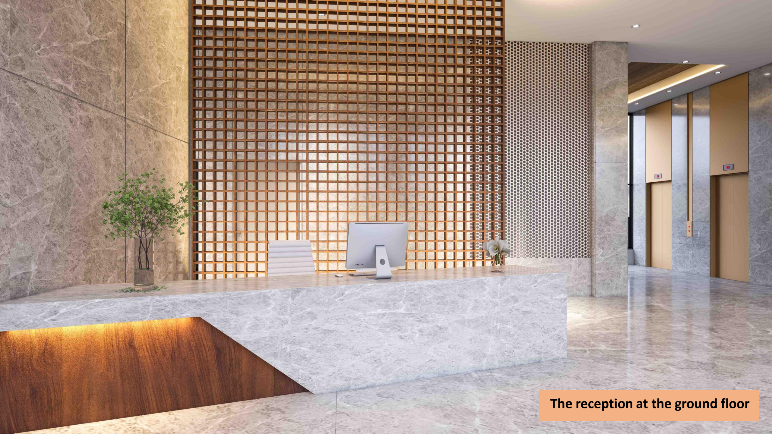
The reception at the ground floor