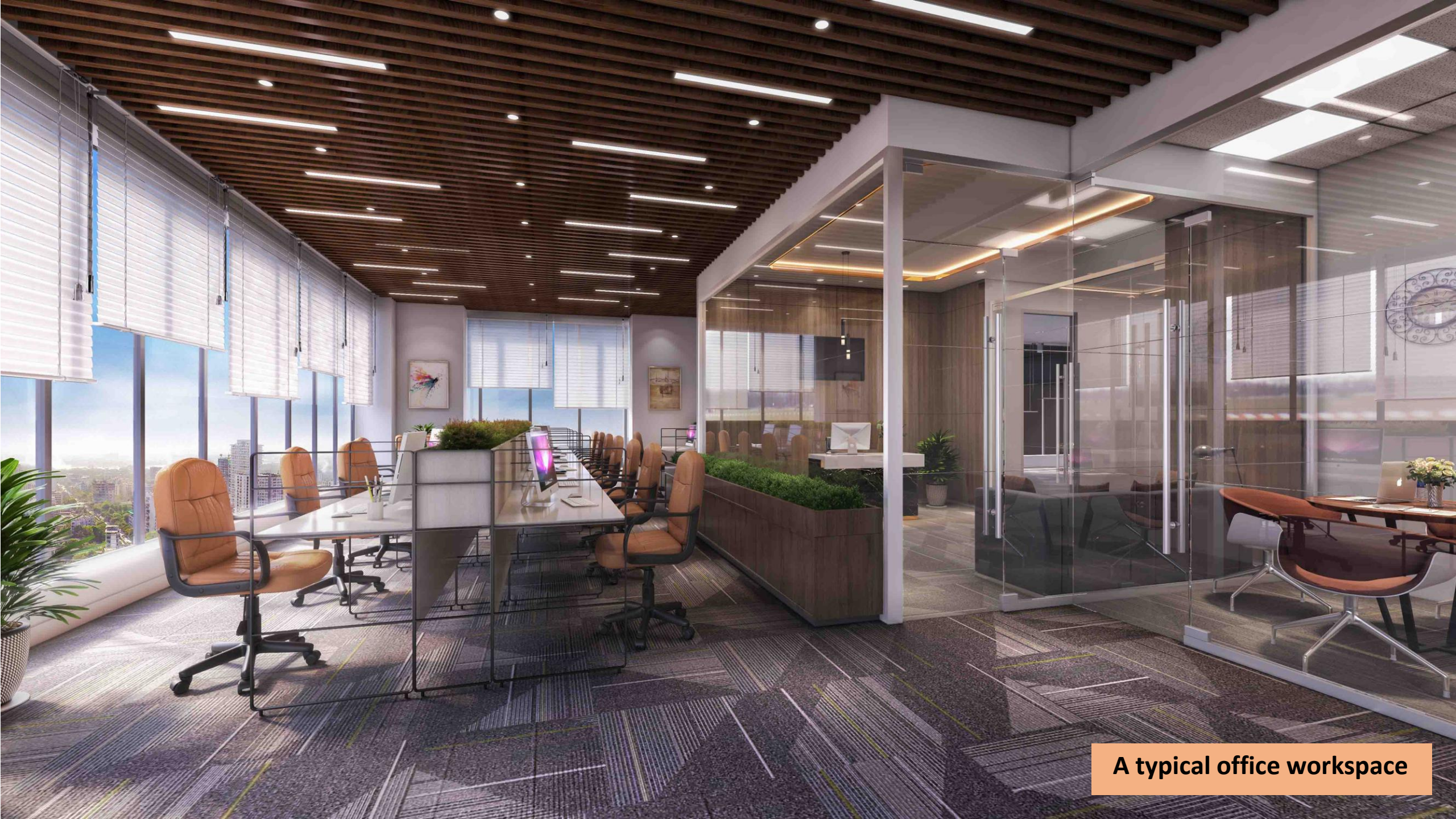
A typical office workspace