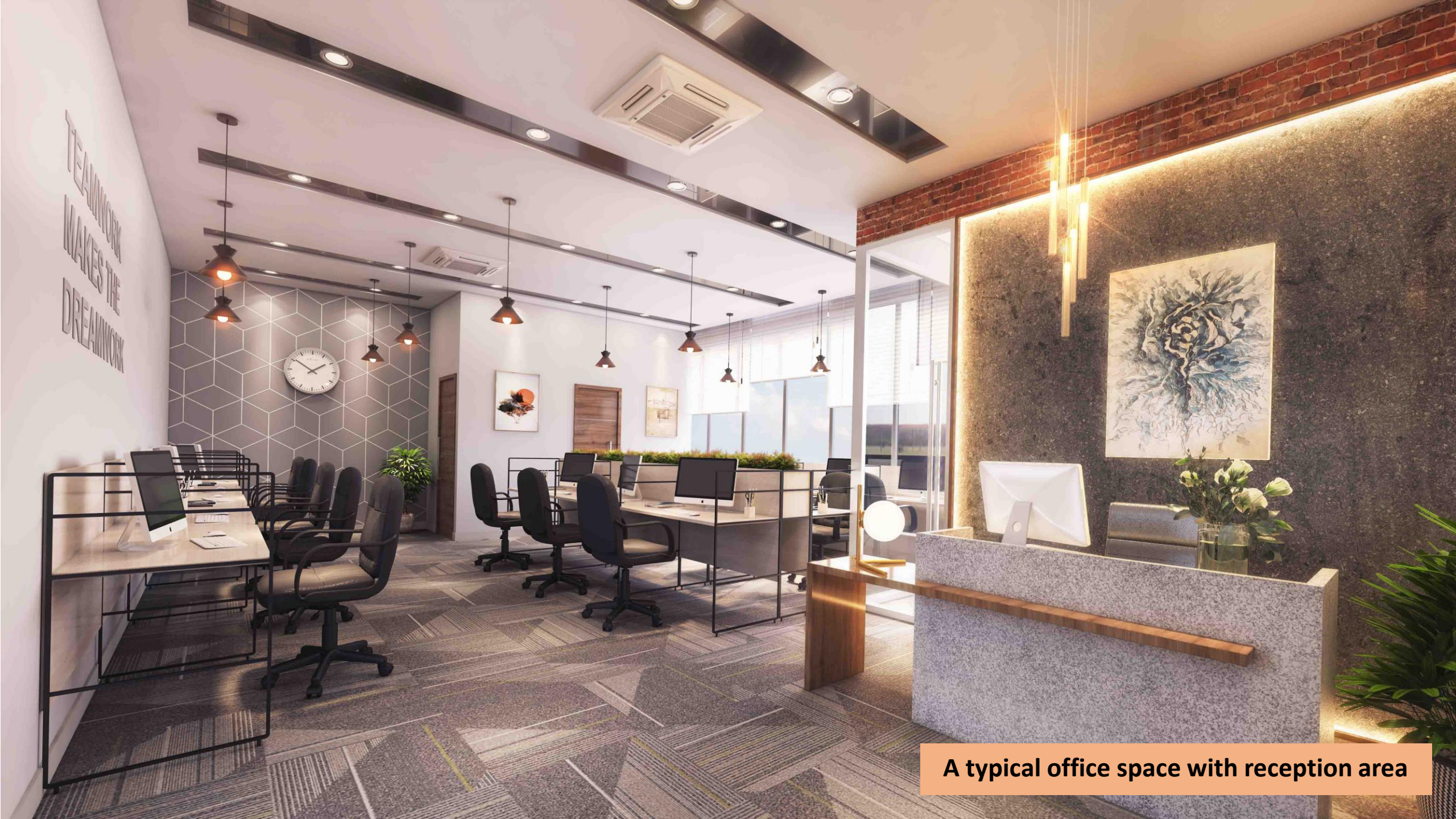
A typical office space with reception area