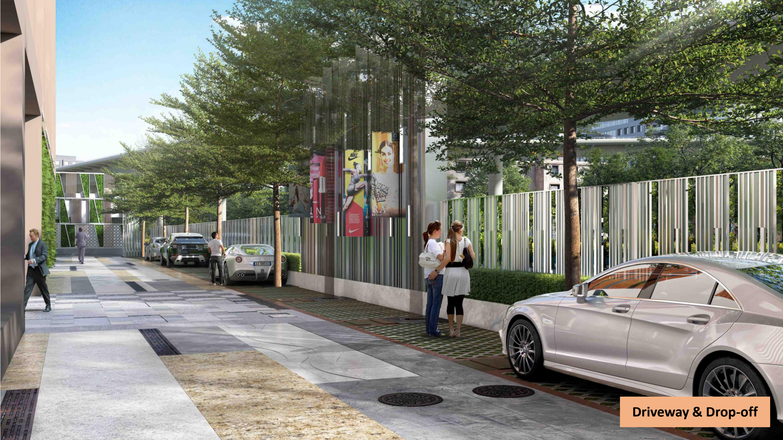
Driveway & Drop-off