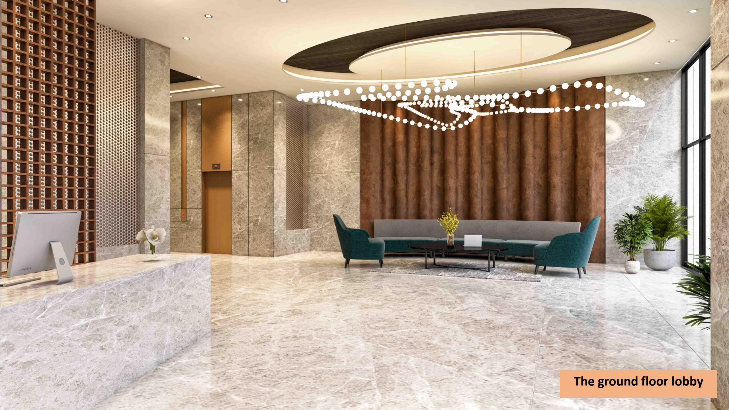
The ground floor lobby